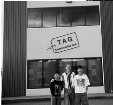
Tag Construction, Ltd.