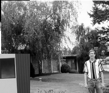
Jack Cewe Ltd.