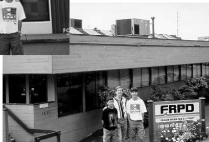
Frasier River Pile & Dredge