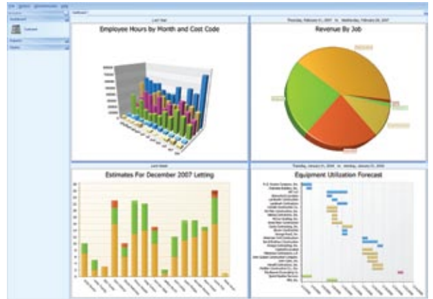
The charts and graphs in the Advanced Reporting application allows you to see important information at a glance to help you make decisions.

Unlike general dashboard software, this software is aware of the data structures of HCSS products, making it much easier to use to get the kind of data construction professionals are likely to need. We at HCSS are very excited about this new product and its ability to help get the right information to the right people at the right time. This contributes to our goal of helping your company achieve operational efficiency and create knowledge workers.